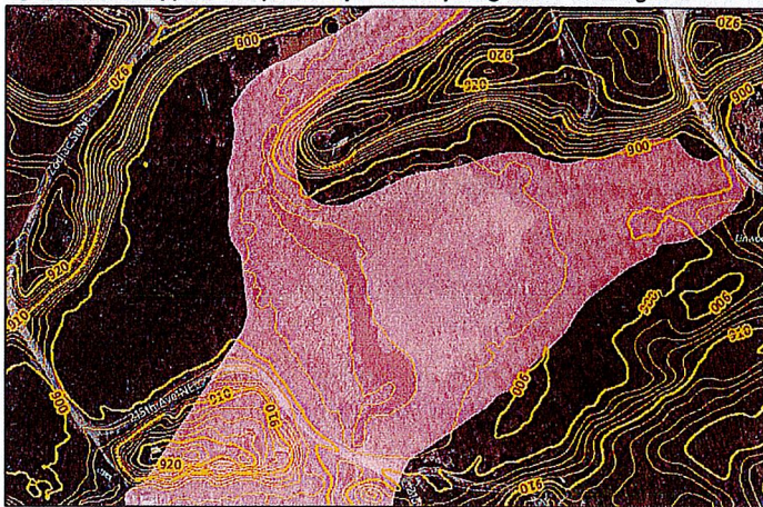
Figure 1: The mapped floodplain may not always align with on-the-ground contour elevations